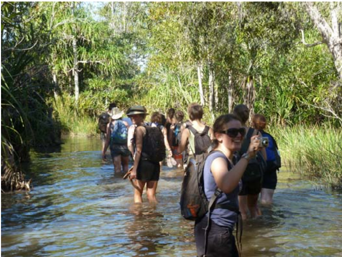
Operation Wallacea: Madagascar