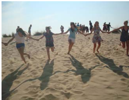
Running down the dunes in Doñana

Amongst the surrounding areas we visited the famous Mezquita (Mosque) in Córdoba and enjoyed the white-washed houses and the narrow cobbled streets in its Barrio Judío , (Jewish Quarter); we also enjoyed an amazing ride on 4x4s across the Doñana National Park in the Huelva province, which is the largest National Reserve in Europe: we loved the dunes and the wildlife and, of course, the bumpy ride along the never-ending coast-line!. Huelva is renowned for its long, clean beaches, so we stopped at the Playa del Mazagón for lunch and a swim, and found the water surprisingly warm for that time of year!