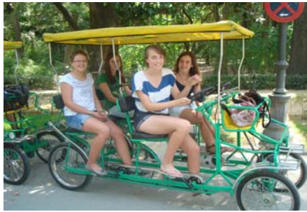
Four-seater bikes at the Parque María Luisa

We all, Spanish and English, went on a cruise along the Guadalquivir river in Sevilla and enjoyed the city's architectural lavishness in the mixture of Christian, Muslim and Jewish styles in some of its most renowned buildings, such as the cathedral and its famous tower La Giralda , from where we enjoyed magnificent views of the city.