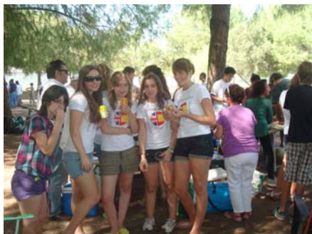
Picnic at the Alamillo

Amongst the surrounding areas we visited the famous Mezquita (Mosque) in Córdoba and enjoyed the white-washed houses and the narrow cobbled streets in its Barrio Judío , (Jewish Quarter); we also enjoyed an amazing ride on 4x4s across the Doñana National Park in the Huelva province, which is the largest National Reserve in Europe: we loved the dunes and the wildlife and, of course, the bumpy ride along the never-ending coast-line!. Huelva is renowned for its long, clean beaches, so we stopped at the Playa del Mazagón for lunch and a swim, and found the water surprisingly warm for that time of year!