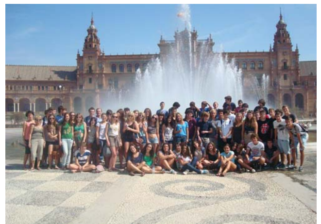
Group photo at the Plaza de España

People from Southern Spain in general, and Sevilla in particular, are renowned for their friendliness and conviviality, and they certainly lived up to their reputation: evening outings and "fiestas" were in order, of course, and we were overwhelmed by our host families' warmth and hospitality, which we'll endeavour to reciprocate when they return their visit in March! We can't wait!