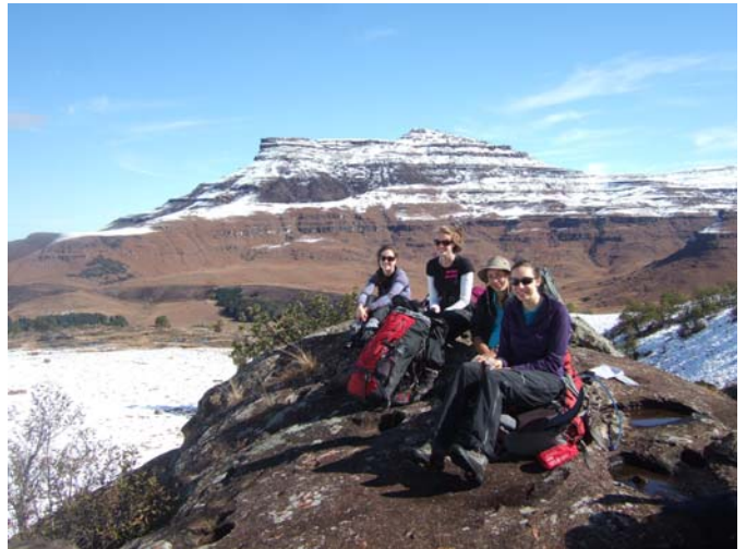
World Challenge: South Africa