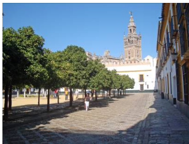
Sevilla, La Giralda