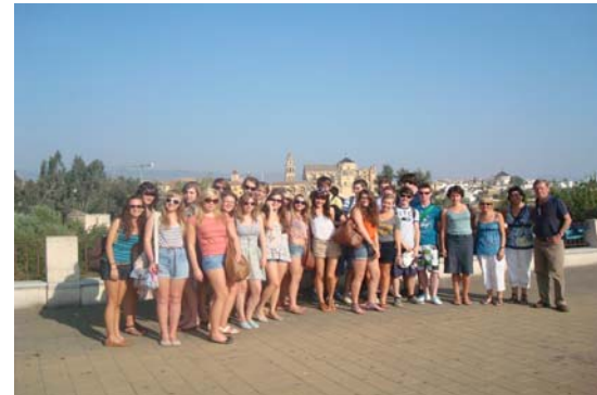
Outside the Mosque ( Mezquita de Córdoba)

Temperatures were well above 30°C all week, so we also had a chance to have a fabulous picnic in Parque del Alamillo on the Sunday, when all the families brought typical Spanish tapas and dishes, and where part of the fun in the sun seemed to involve lots of volleyball!