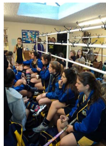
U14 hockey team