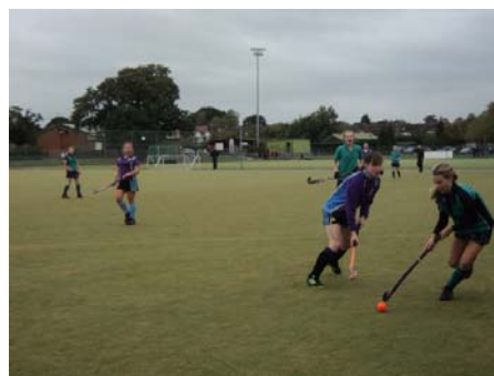
U14 Warwickshire tournament