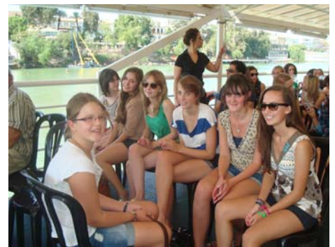
On board the cruising ferry English and Spanish together

During our stay in Sevilla, our host school organised a series of day trips to show us the highlights of the city and some surrounding areas. SGSG girls and KES boys were very lucky indeed to have all their Spanish partners released from some of their lessons and joining us in many of the activities that had been prepared for us.