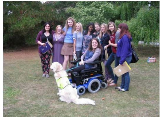
Exam Results: A-level (above) and GCSE (below)

This enormous breadth of activity adds to the great richness of education at Shottery, to say nothing of the fun and extra stimulation to learning that such opportunities provide. But of course the good reputation of the school rests on its academic successes as well as on the breadth of the experiences that it offers girls. And in the context of academic success, it is of course the daily foundation of lessons that forms the core of learning at the heart of the school. That this core is sound has been confirmed by the excellent examination results this summer – see below. My thanks go to the dedicated and sterling staff of the school that enable us to do both!