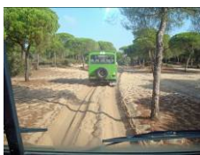
4x4 ride along the Doñana Coastline

Finally, our exchange partners welcomed us with a number of very interesting workshops on Sevillian culture and traditions, which included taster sessions on Flamenco dancing and music, photography, and Andalusian gastronomy, the latter of which affording a delicious mid-morning snack or 'tapa' for everybody! .