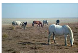
Wild horses in Doñana