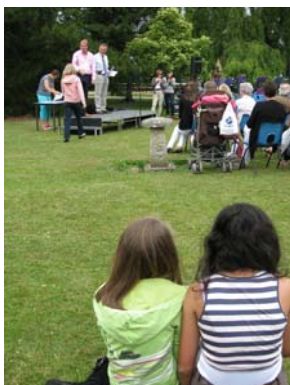
Art and Design Awards