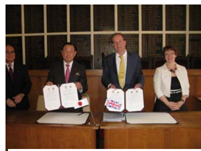
Signing the sister-school agreement with Sano Nihon Daigaku Secondary School, Japan