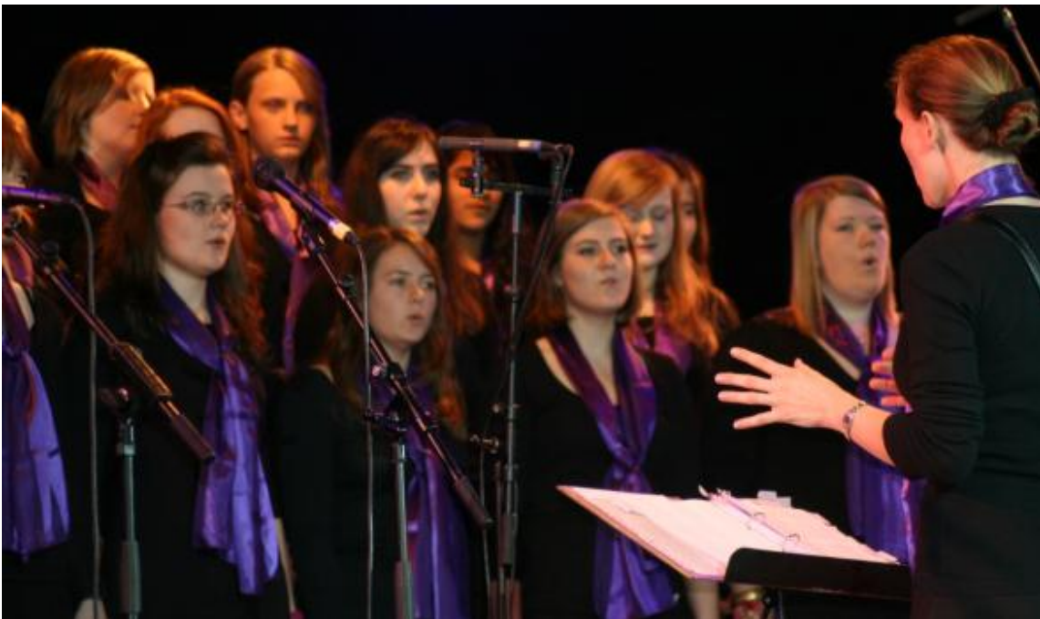
Chamber Choir in Disneyland Paris

The hard-work paid off for Chamber Choir in Paris over Easter, where they were very well received and praised for their professionalism by Disneyland and Chartres Cathedral (with very different repertoire!)