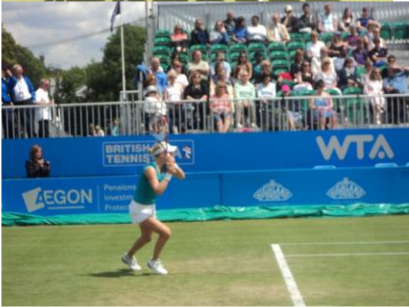
After the girls won, they got to go onto centre court to watch the professional ladies for the rest of the afternoon.