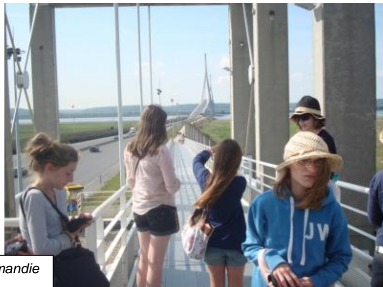
Sur le pont de Normandie