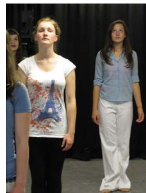
Japanese dance workshop