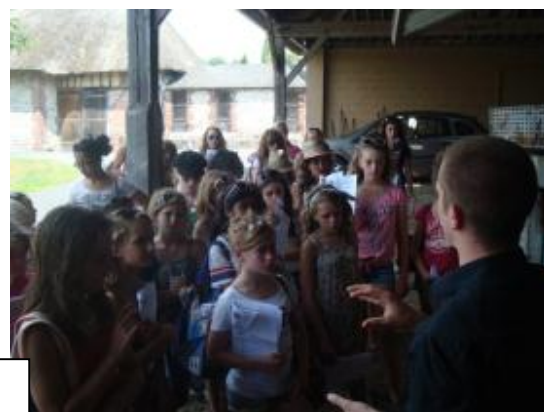
A la ferme