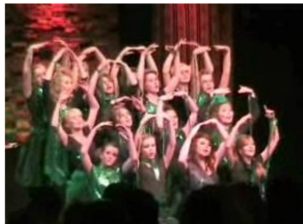
Performing at the Civic Hall