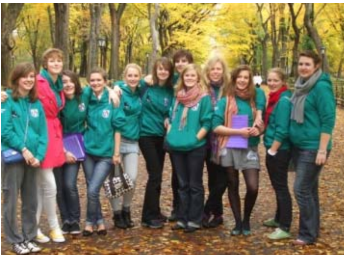
Some of the Year 13 Leavers on tour with Jazz Band

The Music Department has had another busy and successful year!