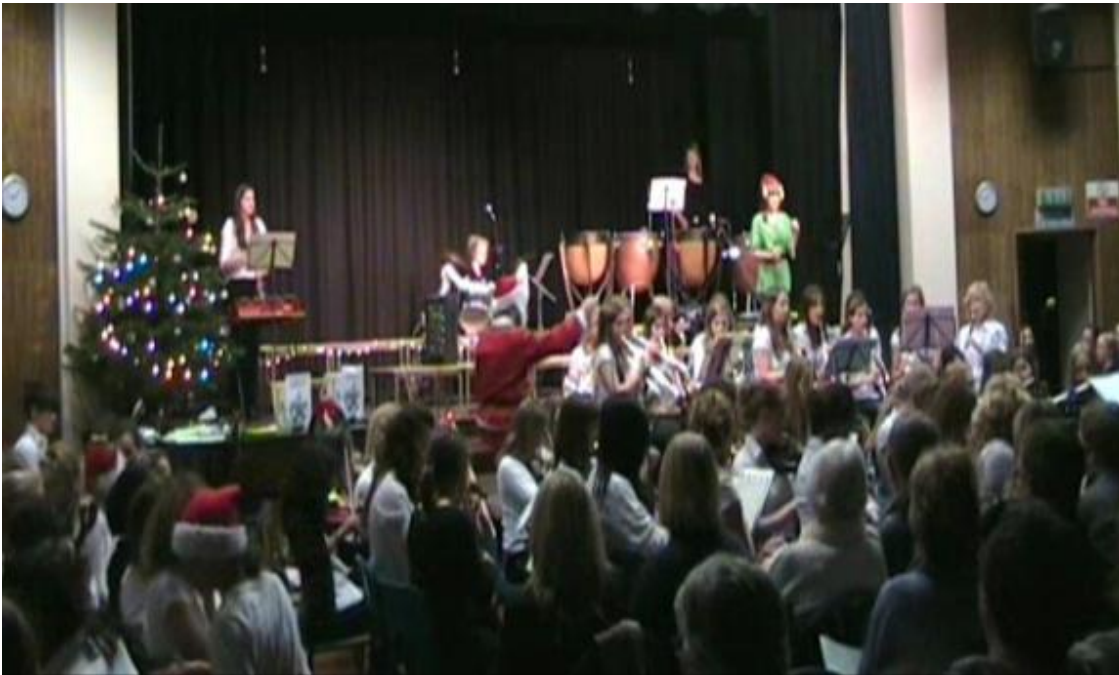
Sleigh Ride featuring Senior Orchestra and Father Christmas!

The term flew by and soon it was the busy Christmas season, with carol singing in the town, Day of Celebration in the Levi Fox Hall, two Christmas Concerts and a Christmas Service!