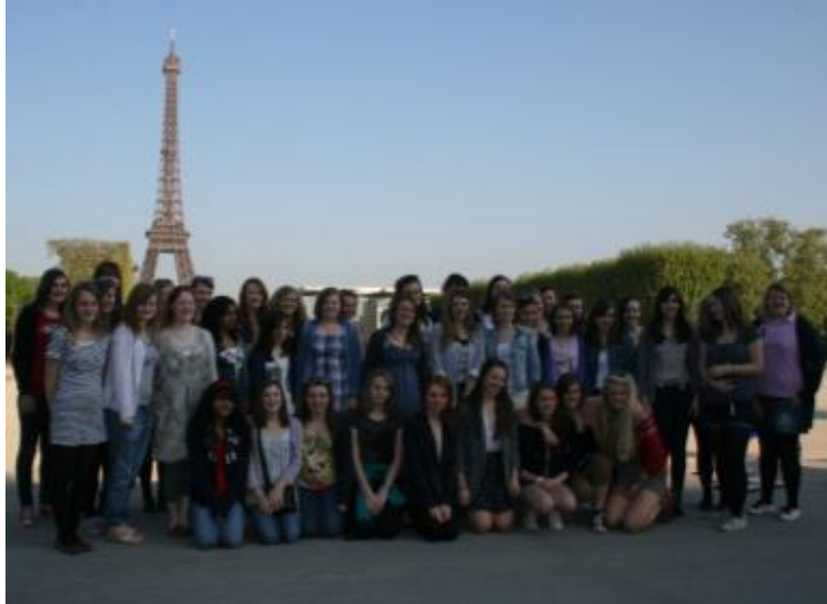
Chamber Choir sight-seeing in Paris

Whilst there, we also took the opportunity to do a spot of sight-seeing, shopping and a surprise backstage tour of the Paris Opera House, with its famous legends of the Phantom of the Opera!