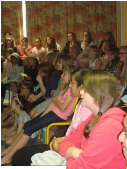
Le "variety show"