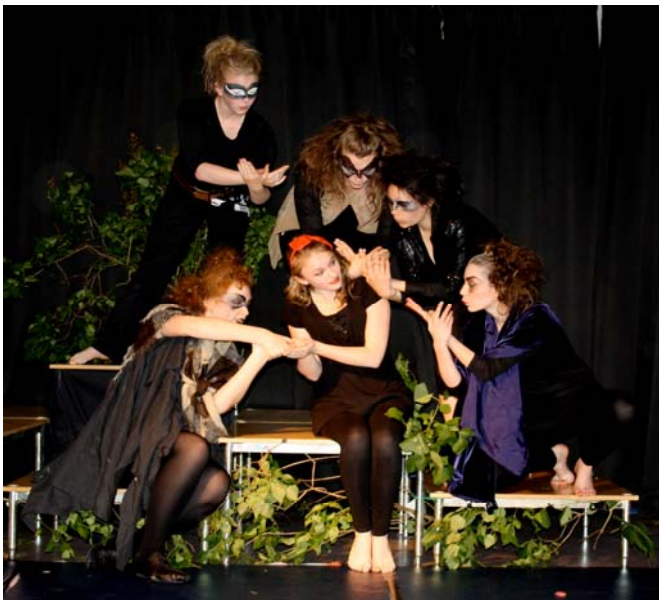
Year 13 Devised Performance: Snow White

This term, Year 12 and 13 have had their practical exams. Congratulations to all students involved with these. Their work was of an excellent standard, of which they can be very proud.