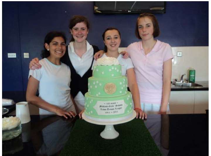
Our girls with the 'birthday' cake!