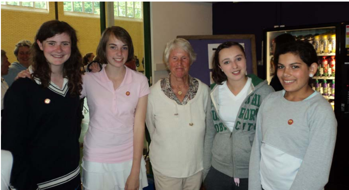
Former Wimbledon Champion Ann Jones with the Shottery team at the Midland Girls' Schools Lawn Tennis League 100 th Tournament