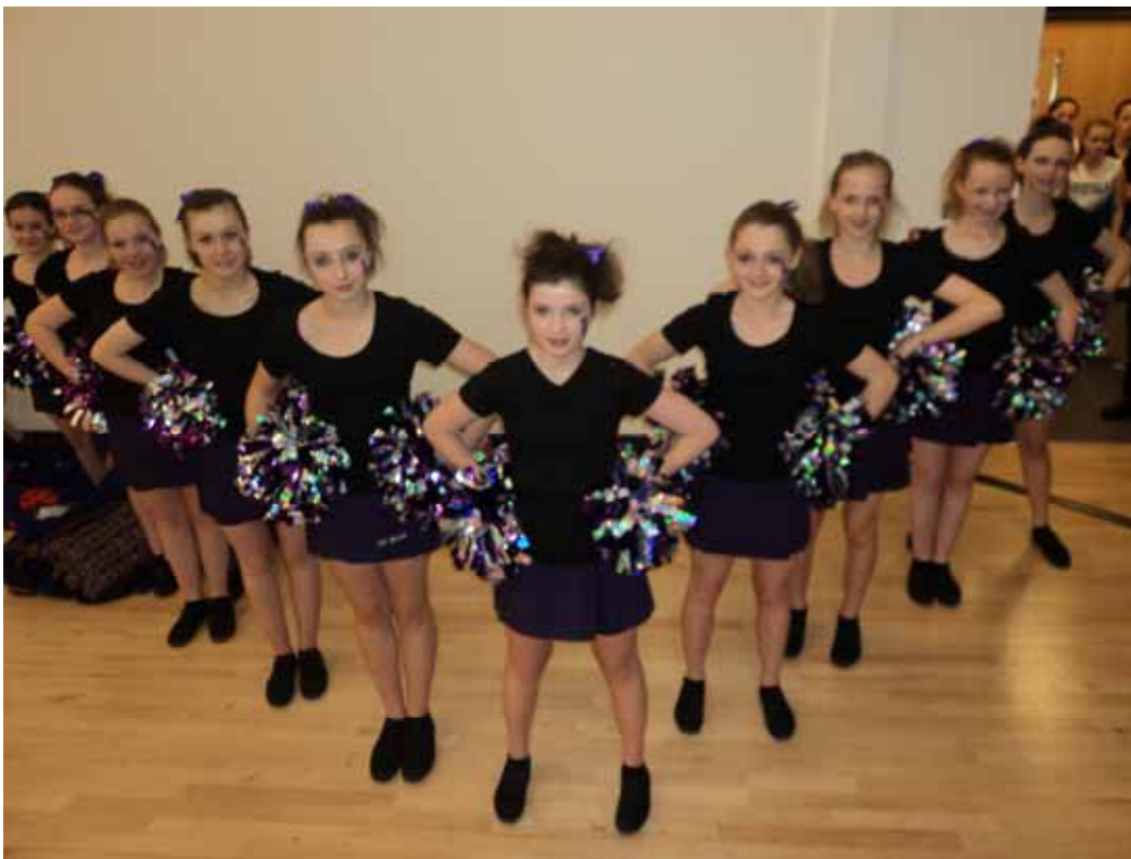
Street Cheer: Year 8 Team