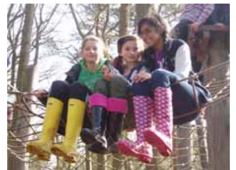
Year 7 visit to Coombe Abbey

We introduced a new element into our learning programme this year, and followed up the target-setting day in the autumn term with a Review Day at the end of March. This was, I think, a very successful exercise, with each girl having a one-to-one interview with her tutor, either reviewing her progress against the targets set earlier